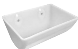
Typ - MPS