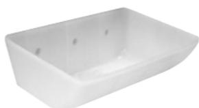
Typ - MS